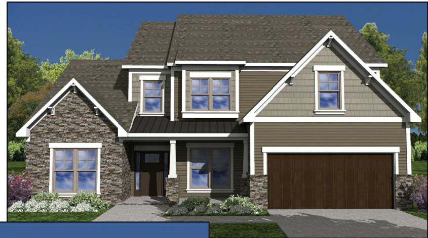
HAMPSHIRE - ELEVATION 'A'