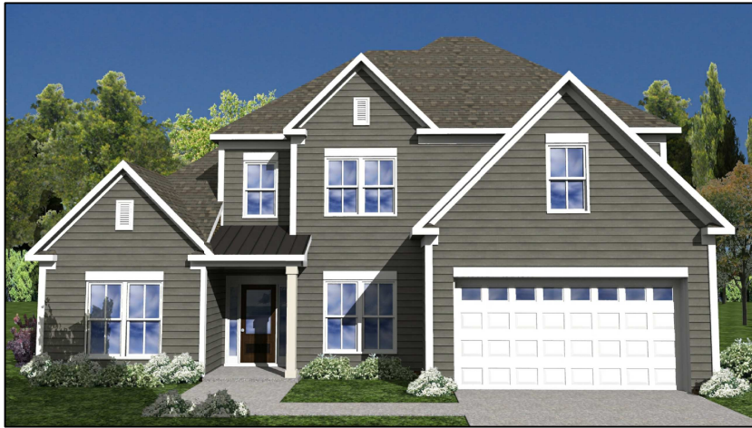
HAMPSHIRE - ELEVATION 'CLASSIC'