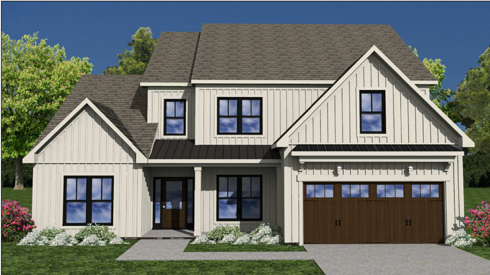
HAMPSHIRE - ELEVATION 'B'