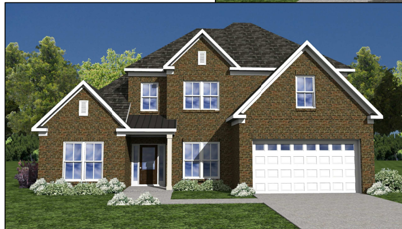
HAMPSHIRE - ELEVATION 'C'